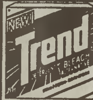
100 oz. box Family Size Trend