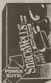
6.7 oz. pkgs. Devil's Food Snackwell Cookies