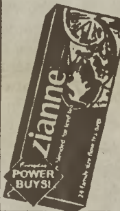
24 ct. box Luzianne Tea Bags