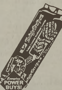
9 oz. pkgs. Assorted Flavors Keebler Cookies