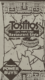
15 oz. bag Restaurant Style Tostitos Chips