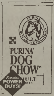
22 lb. bag Purina Dog Chow