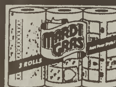
3 ct. pkg. Mardi Gras Paper Towels