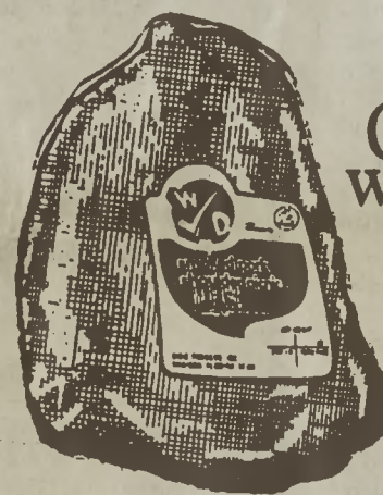
the Other white meat.

Lean & Tender Cube Steak $1.88 lb. Regular Size Pkgs. lb. $1.98