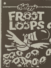
15 oz. box Kellogg's Froot Loops