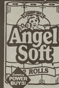
12 roll Angel Soft Bath Tissue

Computer buying gives you a lower price for a longer period of time!