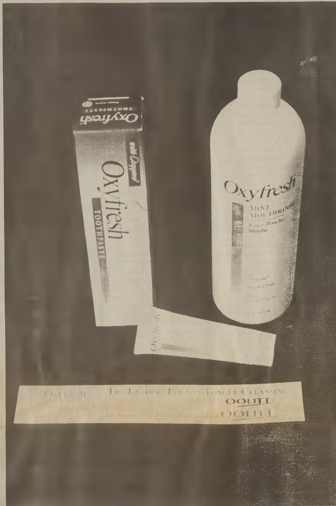
Oxyfresh's Fresh Breath Kit is touted as a solution for bad breath.

Oxyfresh has been around for 12 years and it was initially used to help treat patients with periodontal disease