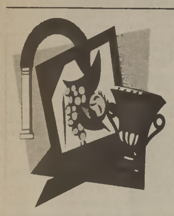
ART GALLERIES & EXHIBITS

ABSINTHE GALLERY 3205 N. Davidson St. Free and open to public. For more information, call 875-8728 or