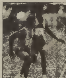
AT THE RELAYS: Norfolk State sprinters exchange baton en route to 4 x 200 relay crown.