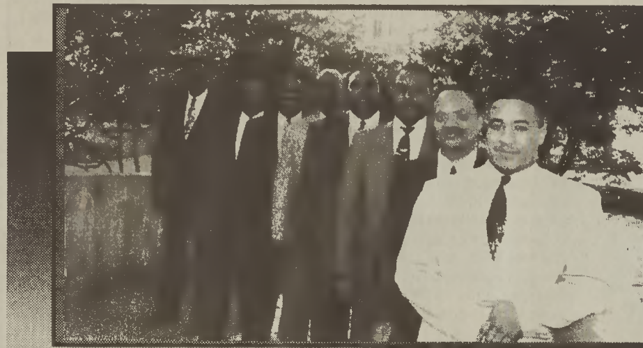
1996 Civic League bachelors await selection during Friday's annual event.

Brothas and sistahs, if you are looking to have a great time and meet some of Charlotte's interesting people, they'll be waiting for you at the Sizzlin' Bachelors Auction. Going once, going twice, gone.