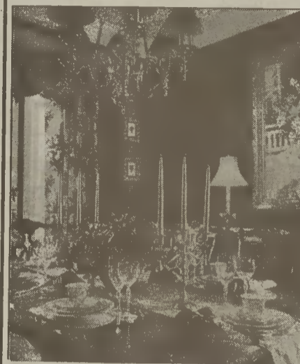
SHOWN: IDS DESIGNER SHOWHOUSE PROVIDENCE COUNTRY CLUB