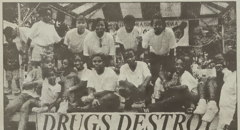
Fighting Back: Members of The Fighting Back Youth Advisory Council help spread the message that Drugs Destroy Dreams. The organization serve as volunteers at all Coca-Cola Culture Jam's and many other community related activities.