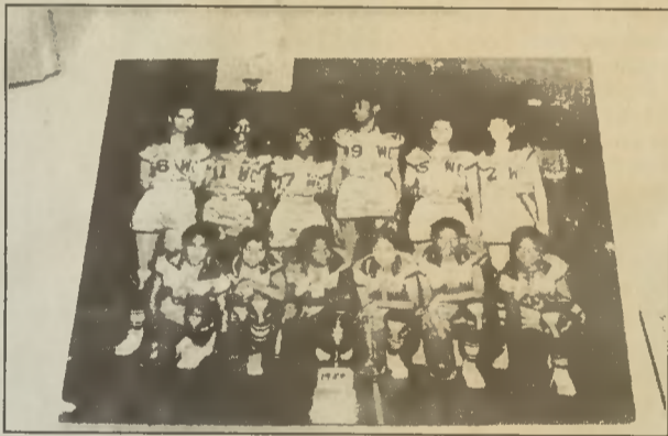
"Hoop and Goals" exhibit at Museum of New South features women's basketball team from west Charlotte area.

The move to a single location came as a result of the museum's increasing popularity. "We got calls from people