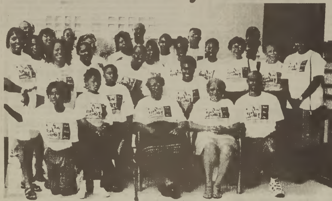
Members of the Williams family gathers in Myrtle Beach to celebrate its 10th Reunion. The family created a family collage in honor of its anniversary. Approximately 175 family members traveled to Myrtle Beach to participate in the activities.