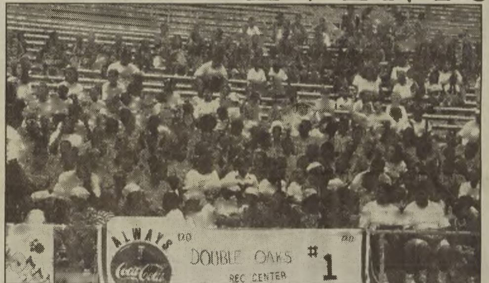
Kids Challenge: The Mecklenburg County Park And Recreation Department hosted an Olympic "field day-style" event for approximately 1500 area youth who participated in the summer day camp program. The Coca-Cola Community Team was on hand to provide ice cold products for the participants.