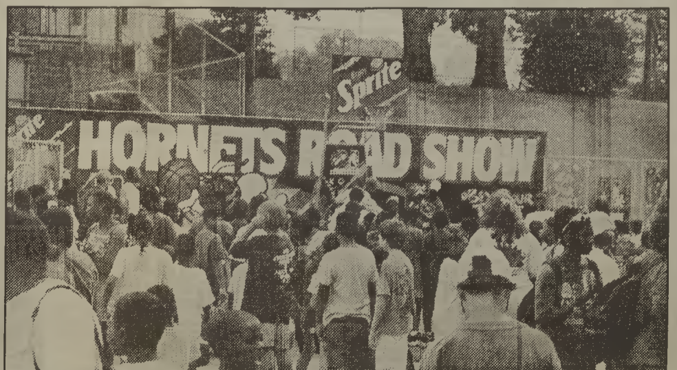
Sprite Hornets Road Show: The Sprite Hornets Road Show was a big attraction at the Park and Recreation Kid Challenges, fifteen area recreation centers competed in the basketball competition and other activities. Look out for the Road Show at the Bi-lo's on Eastway Drive on Thursday, August 22nd, and Bi-lo's on Freedom Drive on Friday, August 23rd from 4:00 p.m. - 7:00 p.m.

If you are interested in the Coca-Cola Community Music Van appearing at your non profit event call: 393-4365. Fax 393-4265.