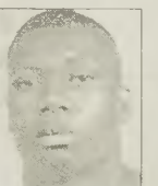
Howard QB shines at Marshall.

Who has less problems, Grambling (0-1-0) or Central State (1-1-0) who face each other in the Silverdome in Pontiac, MI (7:00pm)? Most of Central State's problems may be off the field, where the institution is trying to stay afloat.