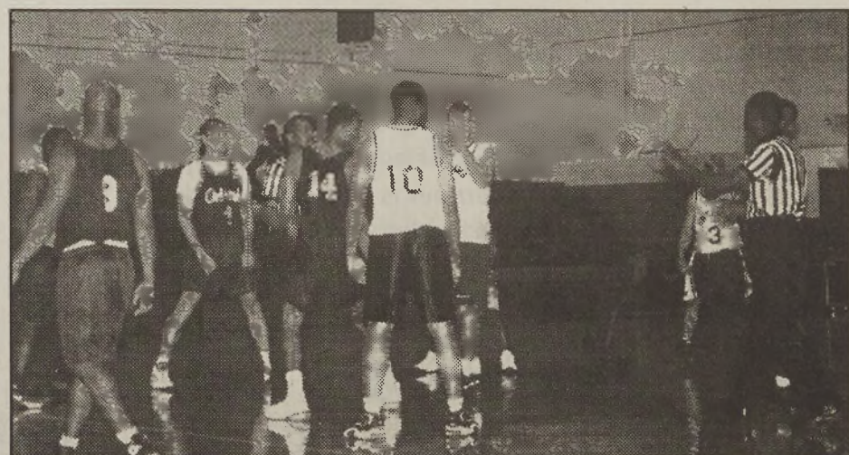
Let The Games Begin'. Some of the top basketball players in the area turned out to play in the Annual Upper Highland Foundation Holiday "Boogie" Crank Basketball Tournament. Coca-Cola co-sponsored the event with proceeds going to three schools in the Highland Community