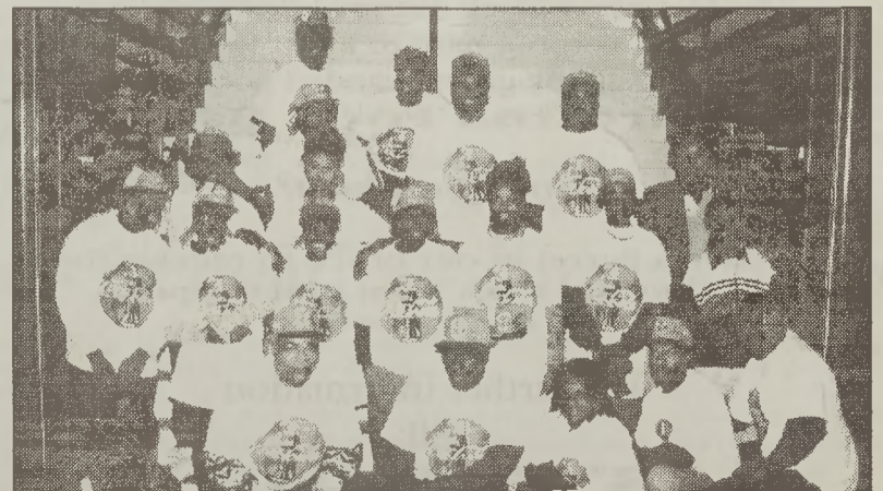
A Coke And A Smile: The very popular "Night At The Hive Program" expanded into Charleston and Columbia, S.C. this year. Youth from Charleston's Weed & Seed Organization enjoyed a personal Domino's pizza, Coca-Cola products and a great night of Charlotte Hornets basketball.