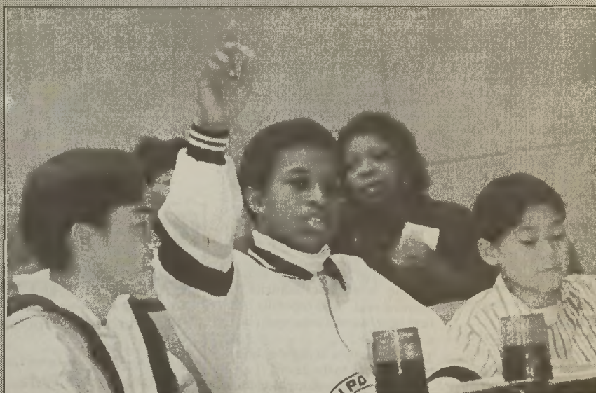
Albemarle Road team and Sedgefield team will compete in national competition March 26-28 in Orlando, Fla. Last year, Kennedy and Quail Hollow middle school teams placed first and second in the national science bowl.