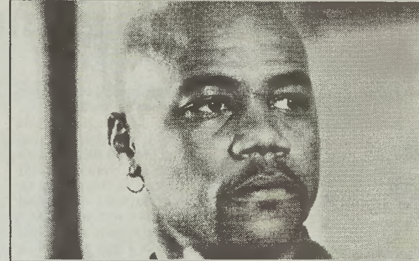
Cuba Gooding Jr.