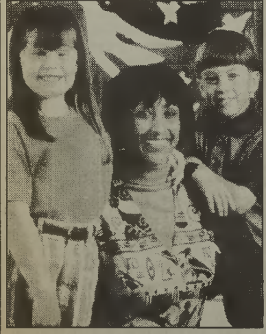
Charlotte Country Day School 1440 Carmel Road Charlotte, NC 28226 R.S.V.P. 362-7255

To Learn, To Shape, To Lead, To Share, To Become.