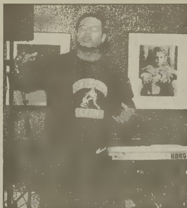
Oc Fest was a hit. Hundreds of folks showed up for the first Oc Fest at Spirit Square. The crowd had a choice of entertainment ranging from visual art to poetry.