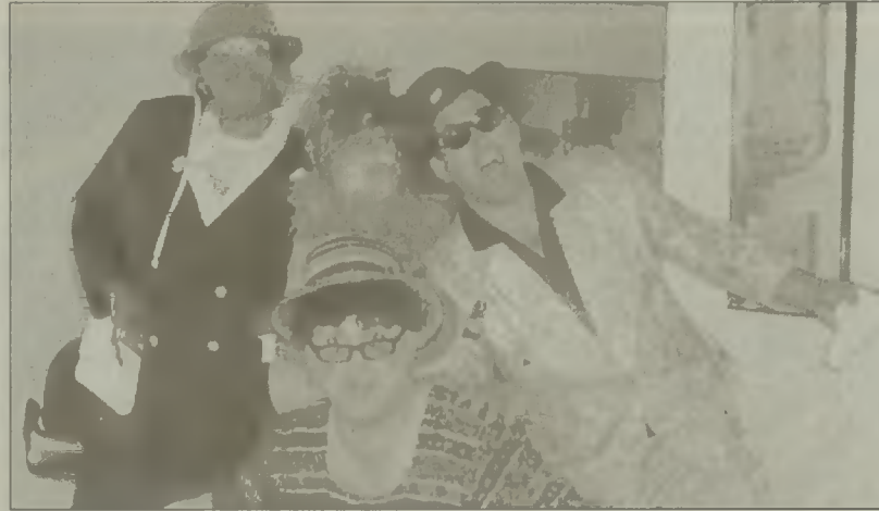
Big Brothers Big Sisters of Greater Charlotte staff was treated to "Ladies Night" by the men on staff. The event was a celebration of the agency increasing its contributions by 30 percent over 2004.