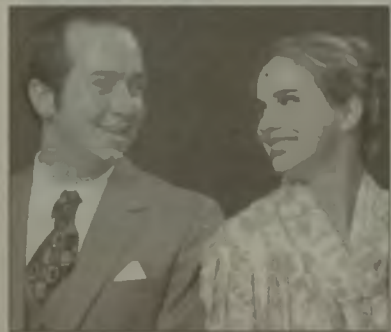
The comedy "She Loves Me" will be performed Oct. 19-23 at Duke Family Performance Hall at Davidson College.