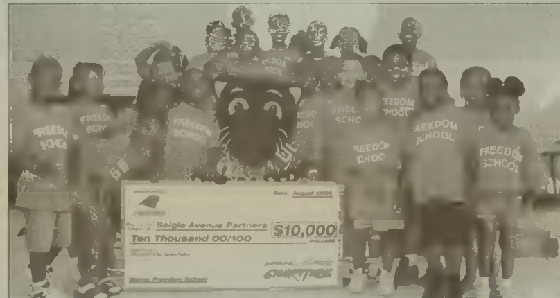
Seigle Avenue Partners received $10,000 from Carolina Panthers Charities to support its after school and summer camp program. Panthers mascot Sir Purr visited 100 children at Seigle Avenue Partners Freedom School, a literacy-based summer camp that encourages love of reading.