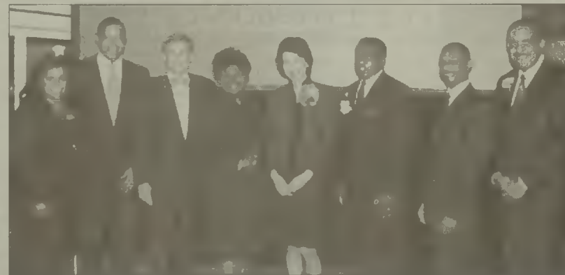
The Thurgood Marshall Scholarship Fund hosted the Awards of Excellence dinner Thursday at Founders Hall. Proceeds went to scholarship programs at public historically black colleges in North Carolina.