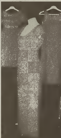
Red is this season hot new color.

Don't be afraid to hit outlet malls. In the Charlotte area, there's the Tanger Outlets in Gaffney and Concord Mills. When you head out to the outlets or discount stores, expect to see a lot of cherry red, cream and khaki. Trench coats are expected