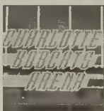
THE PLACE TO BE: New home of the NBA's Charlotte Bobcats was perfect fit for 2006 CIAA Basketball Tournament.

▼ HOOPS TOURNEY BREAKS RECORDS; NEW GRID COACH AT SAVANNAH STATE