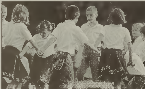
ASHEVILLE FOLK HERITAGE COMMITTEE

Shindig is a celebration of traditional and old-time bands, ballad singers and big circle mountain dancers in Asheville. The festival will be held Saturdays in July