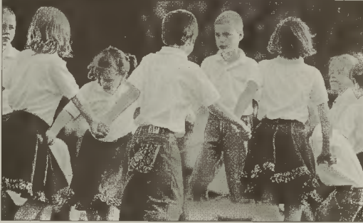
ASHEVILLE FOLK HERITAGE COMMITTEE

Shindig is a celebration of traditional and old-time bands, ballad singers and big circle mountain dancers in Asheville. The festival will be held Saturdays in July.