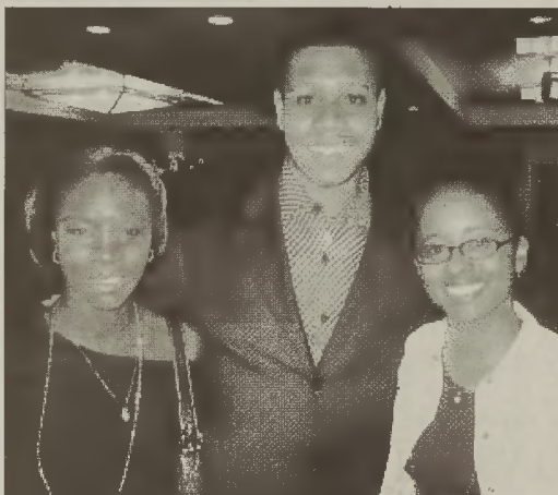
EVENTS & ENTERTAINMENT

Events & Adventures, an activities club for singles, brings together Charlotte's most eligible folks for an evening of mingling. E&A sponsors alternatives to blind dating by bringing people together for activities ranging from skydiving to kayaking.