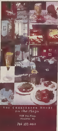
THE CHARLESTON HOUSE on the Plaza 1122 Two Plaza Charlotte, NC 704.333.4431

6. What did John say about those who claim to know Christ but do not live according to His Word (v. 6)?