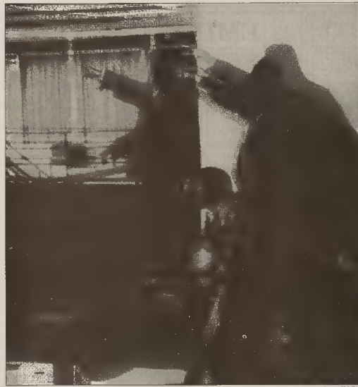
THE LIGHT FACTORY