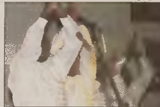
Stepping is in the spotlight due to the success of the movie, "Stomp The Yard."