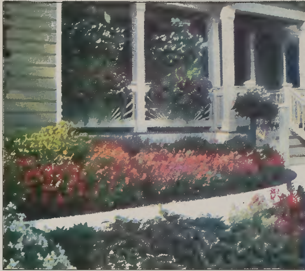
Dimension is an important guideline in building a successful outdoor garden.