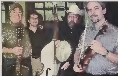
CENTRAL PIEDMONT COMMUNITY COLLEGE

Big Medicine plays string band music of the rural South June 8 at 7:30 p.m. at Bryant Recital Hall, Sloan-Morgan Building at Central Piedmont Community College. The concert is free.