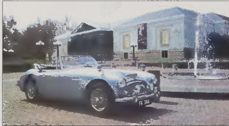
MINT MUSEUM OF ART