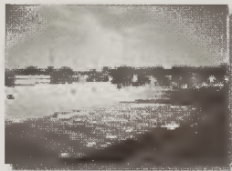
Charlotte Memorial Stadium

The CIAA football championship game, re-instituted in 2000, has been played in Durham and Winston-Salem over the past seven seasons. Durham's O'Kelly-Riddick Stadium hosted the first game in 2000 and the last four. The game