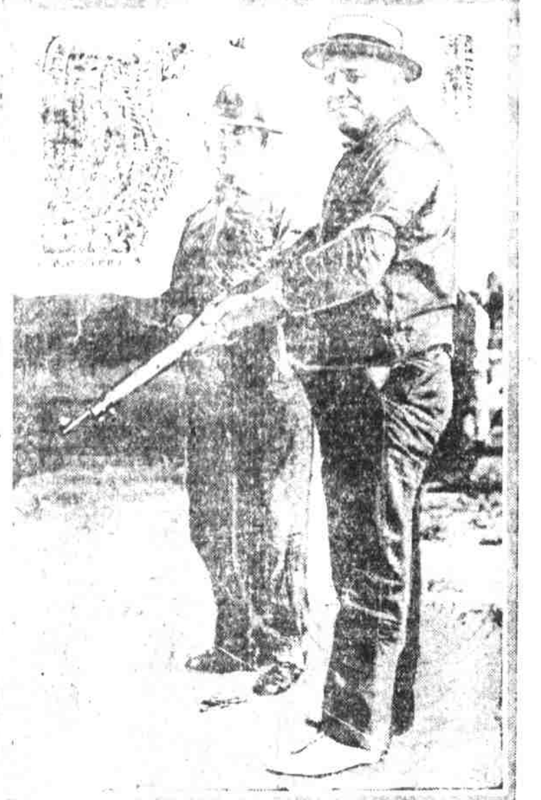
INTERIOR. SECRETARY OF THE

A-1 equipment plus A-1 materials prepared. He has taken rifle practice tange he slips into a pair of overalls, like others who take an interest today. A settlement will likely be ar-