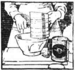
1. Mix and sift flour, baking powder and salt.