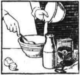
2. Add milk gradually, beating constantly.