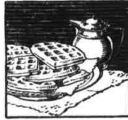
6. Serve with maple syrup.