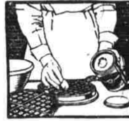
5. Cook in hot waffle iron well greased with Cottolene. Brown first one side then the other.