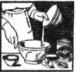
3. Add Cottolene, yolks of eggs well beaten, and whites of eggs beaten stiff.

We agree with you about waffles. They must be crisp. No! We don't doubt that your waffles are crisp. But perhaps you'd like them even more crisp.