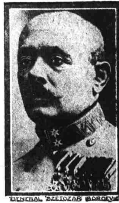
General Sztetozar Boroevic has been named to succeed Archduke Eugene in command of all the Austrian armies pitted against the Italians. The failure of the Austrians to follow up their advantage after the debacle of Oct. 23, is believed to be the cause for the change.