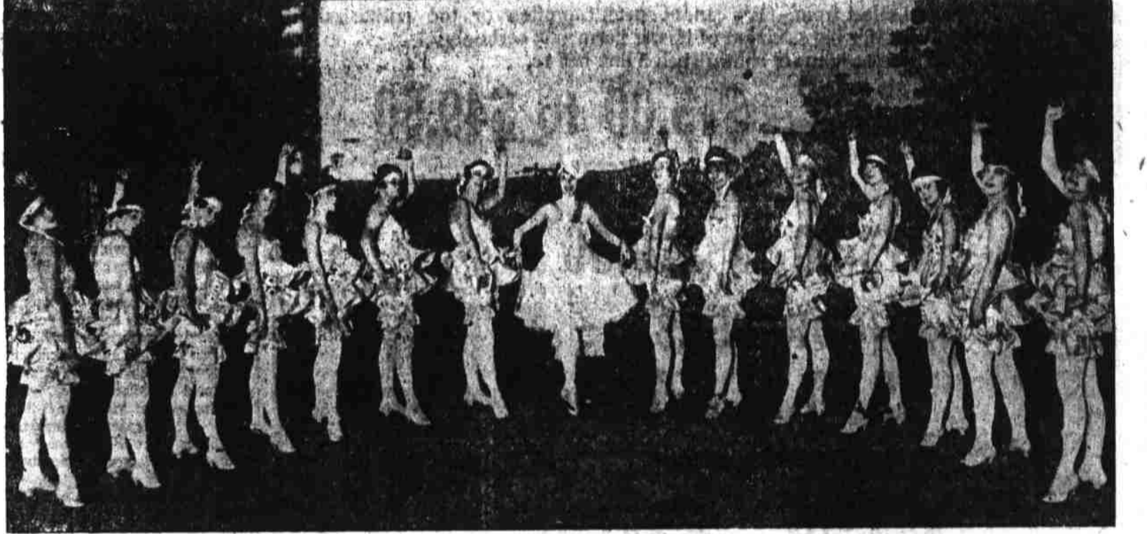
THE FAMOUS "PONY" BALLET FROM THE ROOF OF THE NEW YORK THEATRE, COMING TO SALISBURY WITH THE BIG MILITARY MUSICAL SPECTACLE "MY SOLDIER GIRL," AT THE COLONIAL THEATRE, TUESDAY NIGHT, MARCH 26TH.