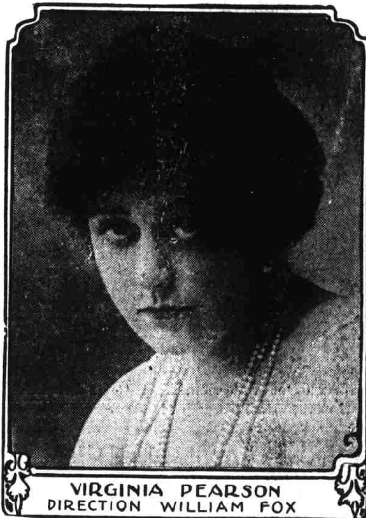
VIRGINIA PEARSON DIRECTION WILLIAM FOX