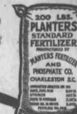
VIEW OF THE