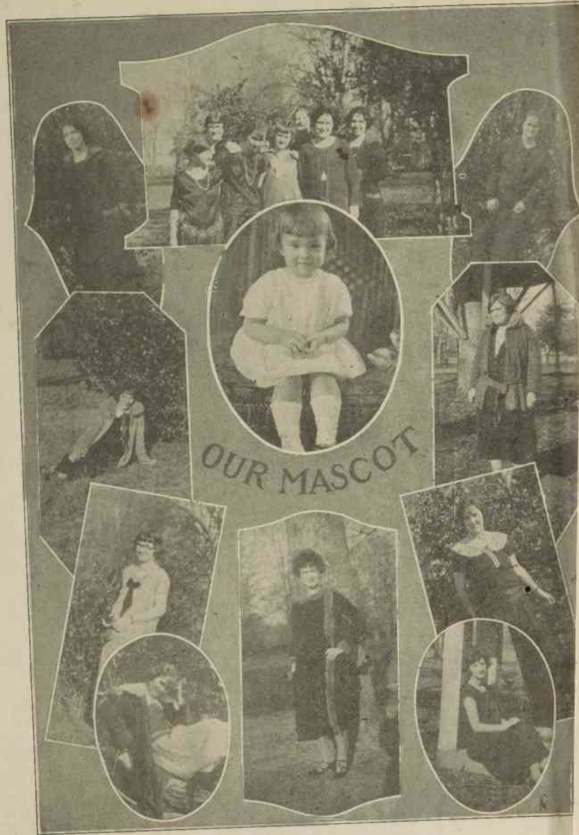
SENIOR CLASS OF 1925