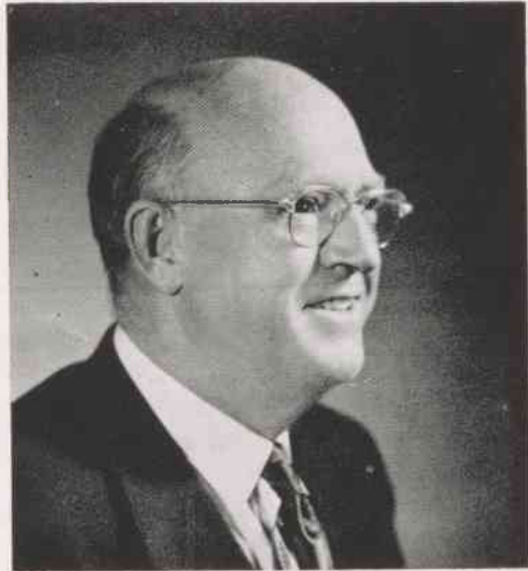
By his works we knew him!