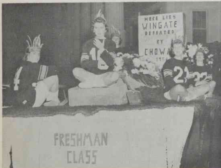
Freshmen Riding on Class Float