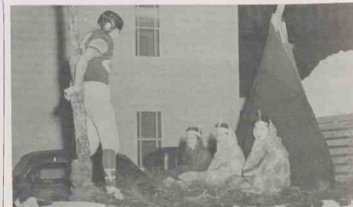
Sophomore Class Float