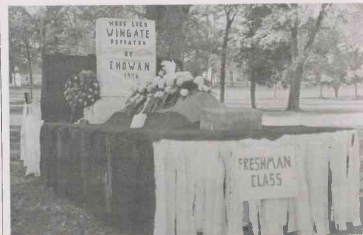
Freshmen Float That Won First Prize