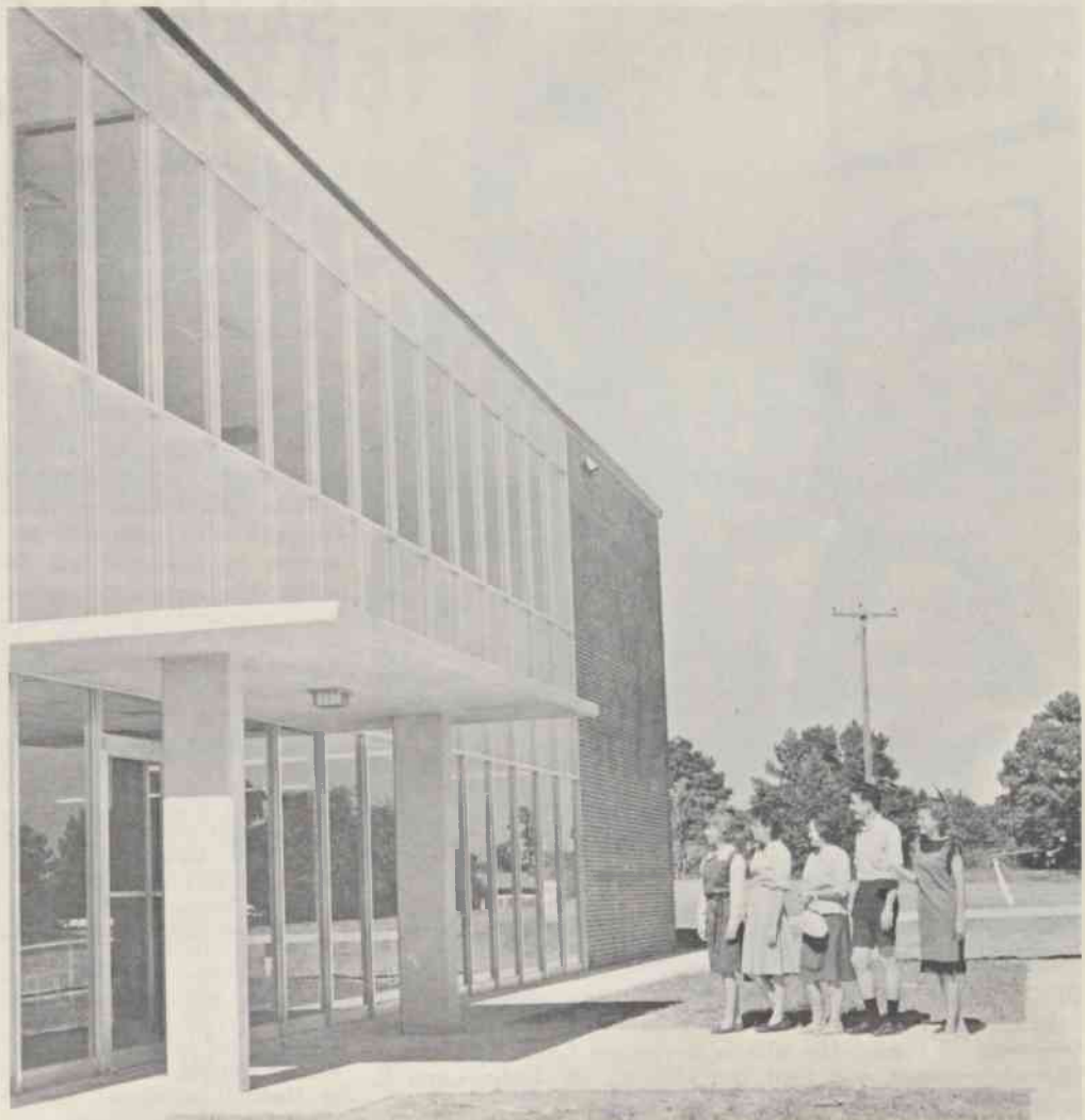
ADDITION TO CAFETERIA—New student center, post office and student store are housed on the ground floor of the cafeteria addition. The upstairs addition doubled the seating capacity, and also houses a private dining room for special occasions.

"Nope," said the boy. "I'm just waiting for my chewing gum to come back."