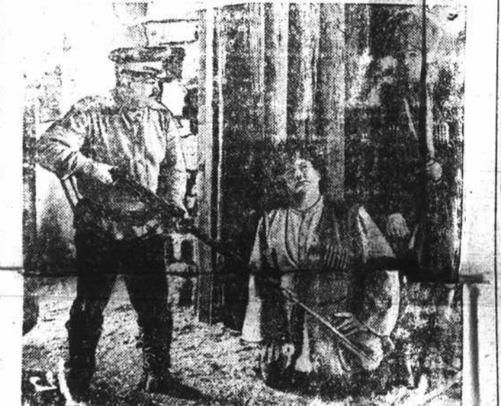
STAN LAUREL and OLIVER HARDY in an hilarious comedy scene from THE ROGUE SONG

Only $1.35 pair for ladies pure silk full fashioned Humming Bird hosiery, both Chiffon silk to tops and service weights with hem tops. Stroud & Hubbard.