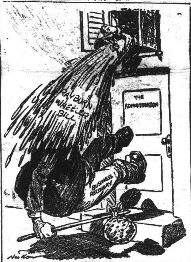
THE PRODIGAL RETURNS