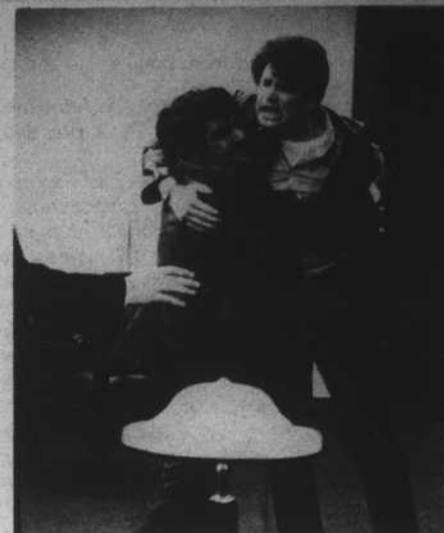
"I told you. . . he's mine, I found him, and I'm going to keep him!" (from "Prince of the City")

In spite of the current sea of relative ignorance of the causes of Kaposi's sarcoma, I