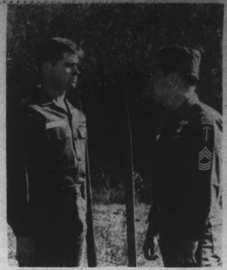
"No, sir! I am not Box 78, in care of The Front Page! Sorry about that, sir!" (from "The Pursuit of D.B. Cooper")

Why be bored on Thanksgiving Day? Open House (b.y.o.b.) 4PM-until at 221 Dacian Avenue Durham (683-1471). (17)