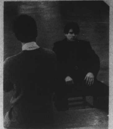
"After sitting here for two hours, you'd think this guy could cruise me at least once!" (from "Prince of the City")

GWM, 31, 5'8", 130 lbs., brown hair/eyes. Seek sincere friends and companions in the Greensboro area to share an honest and caring relationship. Enjoy canoeing, backpacking, reading, movies, theater, music. Do not enjoy bars, S&M, drugs. Am masculine, straight acting, and seek same. Must be discreet. Photo appreciated. Please respond to Box 153, The Front Page. (18)