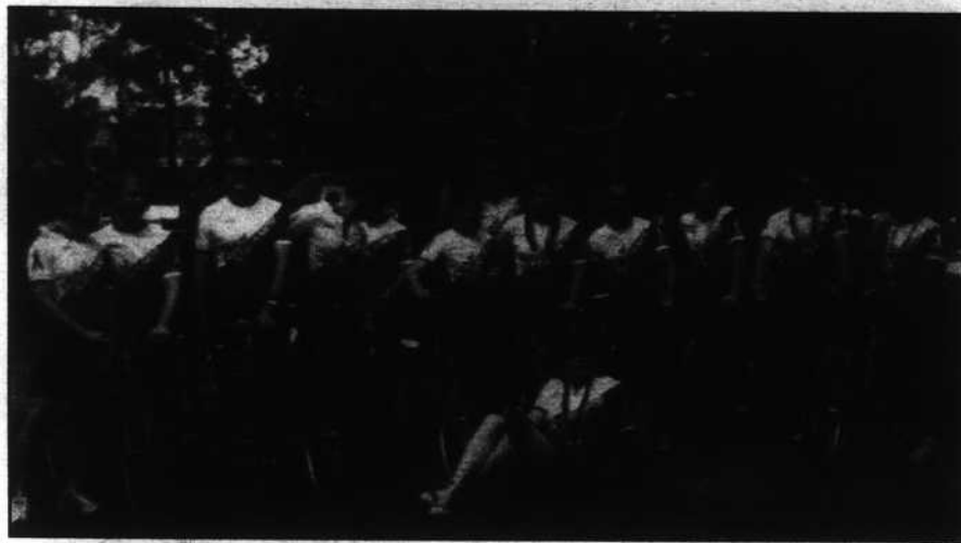
Team Alliance prior to Gay pride Parade in Durham, October 2002.