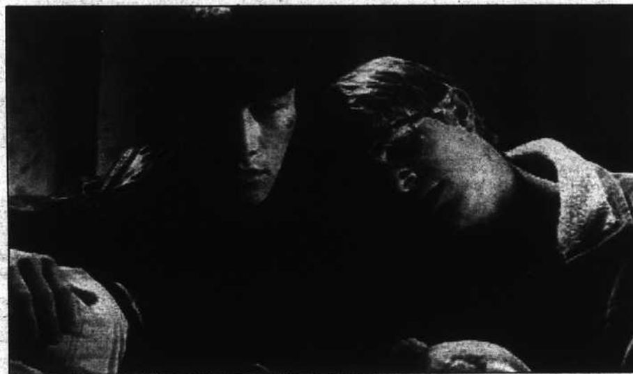
Mysterious Skin , August 14 at 7:00 pm

Since beginning as a summer film series in 1995, the NCGLFF has presented a diverse array of shorts, documentaries and feature films. Many films, such as Nine Lives , Issues 101 , 200 American , Tarheels & Short Skirts , Luster and Camp: The Movie have made their world or regional premiere here.