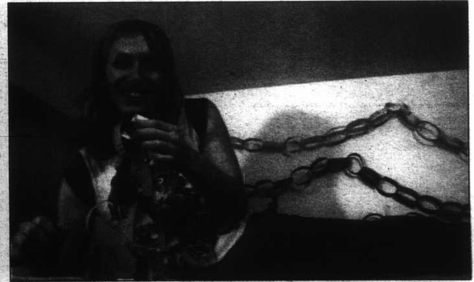
TransGeneration , August 14 at 4:30 pm

Tickets for the North Carolina Gay & Lesbian Film Festival can be purchased by contacting The Carolina Theatre box office at (919) 560-3030. Single tickets are $7.50 and a 6-pack & 10-pack discount ticket block are $38.50 & $62. More information including a daily schedule, hotel accommodations and special events is available at www.carolinatheatre.org/ncglff .