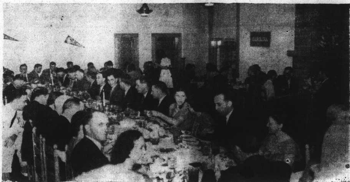
The seventy-odd members of the Northwestern Alumni Association of the Greater University of North Carolina and their guests, who attended the outstanding banquet here recently, really enjoyed eating, chatting, listening to good music and good-speech-making, as the above picture, snapped while the dinner was being served, clearly shows.