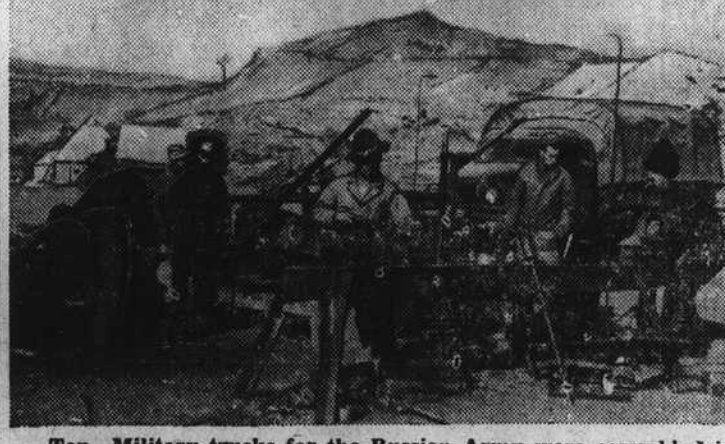
Top—Military trucks for the Russian Army were assembled in the open desert in Iran while a special plant was being constructed for the Army Ordnance Department. These facilities, operated by General Motors, assemble several makes of military vehicles, including Chevrolet and GMC trucks. Center—As in other combat areas, service facilities must often be improvised. Here, in China, the guns of an Allison-powered Curtiss P-40 are being repaired by an American "armament section." Below—Typical of maintenance in the field is this Army outdoor repair shop set up in a United States Army military truck convoy of supplies to Allied troops. The route of this convoy is through the most difficult terrain in Australia.