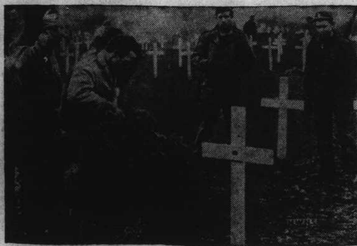
On a lonely strand of land on the far northern island of Attu, wreaths are placed on the graves of fallen American fighters as a bugler blows taps.