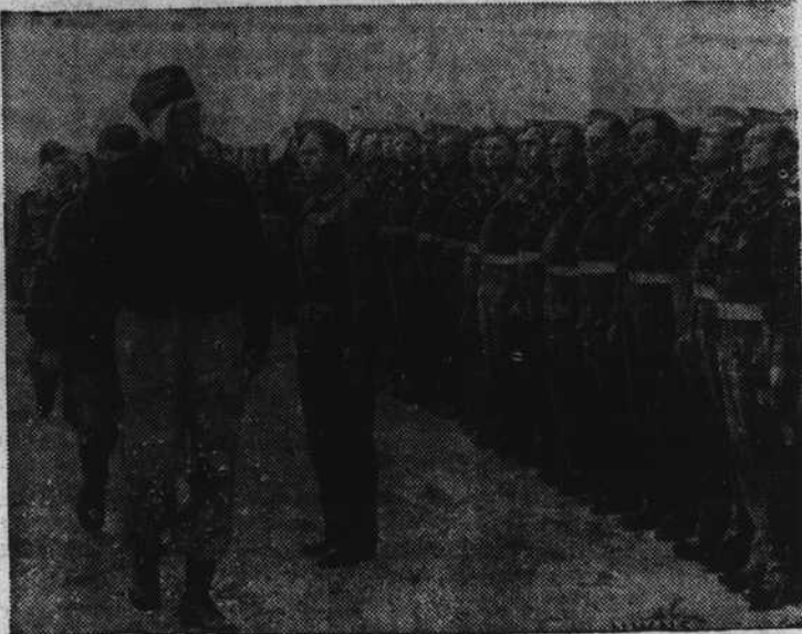
Troops of the Polish armored regiment stand at attention as Lieut. Gen. George S. Patton Jr., of the American Seventh army salutes them during a review of the troops in Egypt.