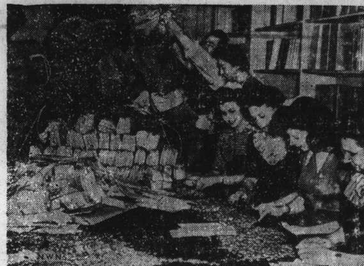
A group of clerks in the White House at Washington, D. C., welcomed the thousands of dimes which descended on the capital during the annual March of Dimes infantile paralysis drive. They are pictured at work during the drive with the dimes.