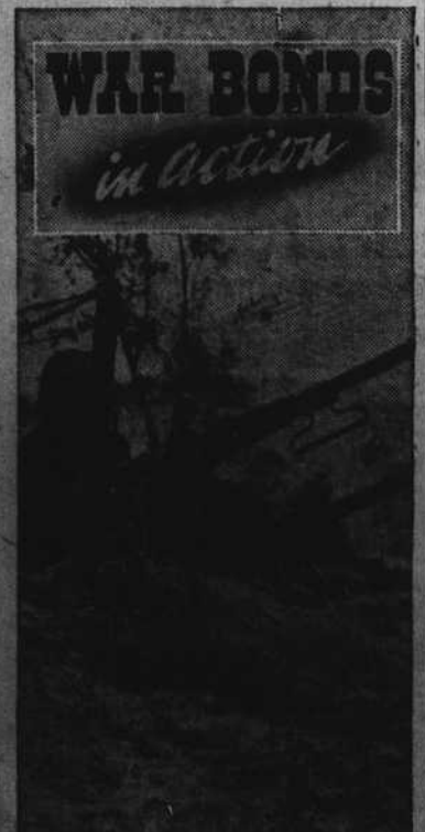
A sprig of green, on the Mediterranean front; today it's camouflage for an American machine gun nest. To win quicker our soldiers must have munitions and materiel, more and more. To provide them all of us must buy more and more War Bonds.