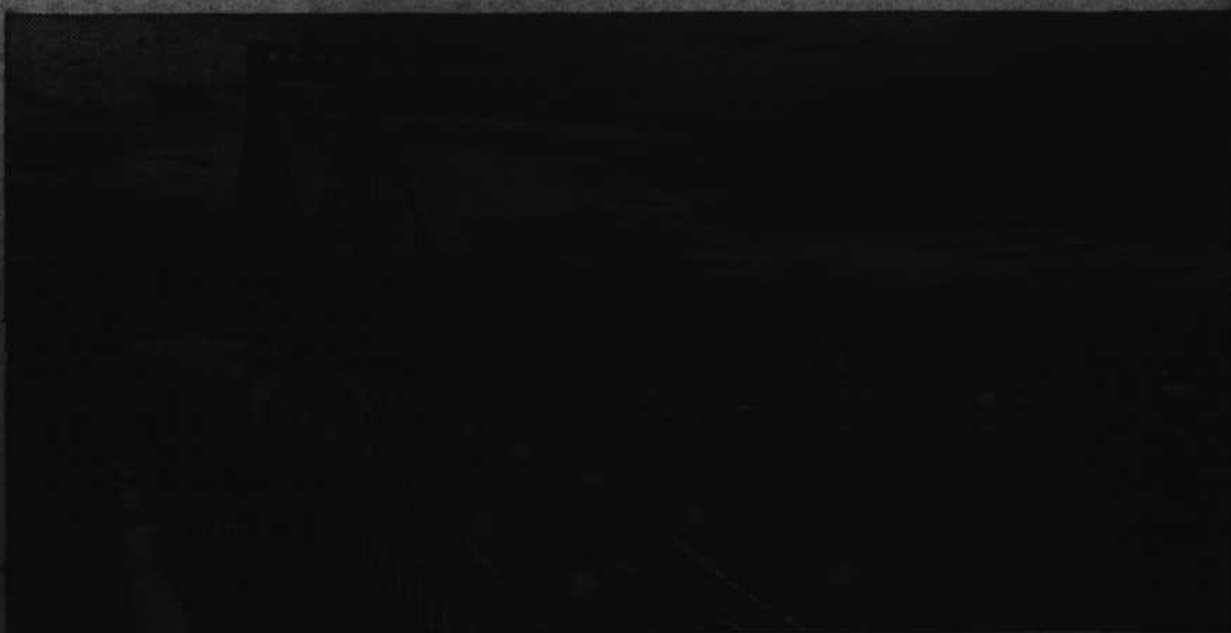
The world's largest sodium lighting installation, the first completed section of the Golden Gate bridge to Oakland, looking toward San Francisco from Yerba Buena Island. Nine hundred and twenty-four sodium lights, the equivalent of 25 full moons makes the highway so bright that car headlights are unnecessary.