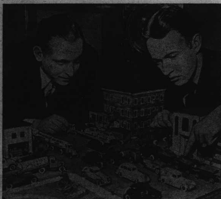
Models of street intersections with dense traffic are used to teach traffic regulations to students at the safe driving school of Lane Technical high school.