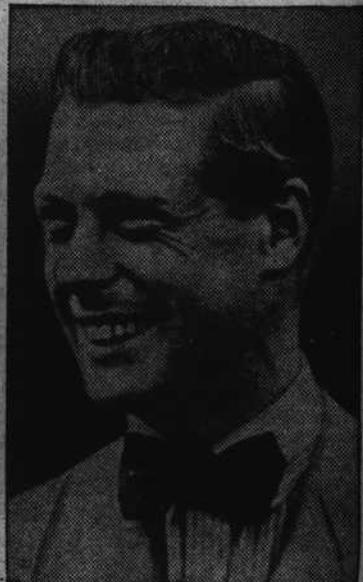
Former King Edward VIII of England who abdicated his throne that he might marry Mrs. Wallis Warfield Simpson, former Baltimore beauty. Edward was succeeded by his brother the Duke of York.