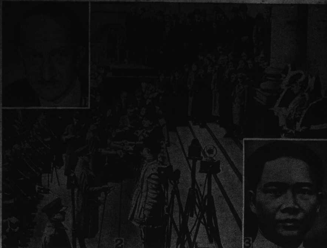
1—Georges Bonnet, former minister of finance, now slated to become French ambassador to the United States. 2—Ceremonies in London at which the Duke of York was officially proclaimed King George VI of England. 3—Generalissimo Chiang-Kai-shek of China who was recently kidnaped by rival war lords.